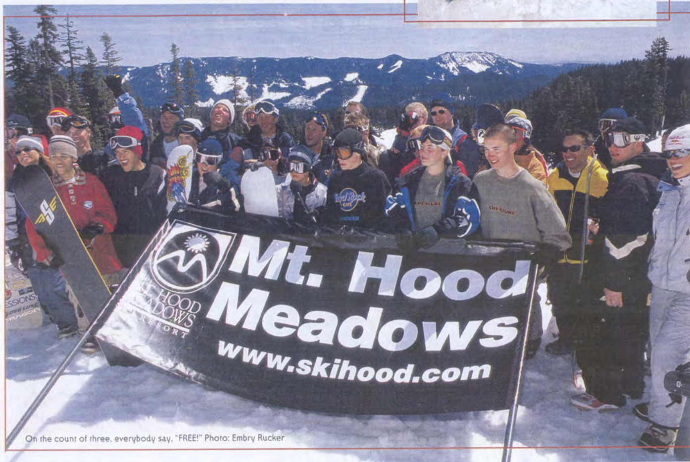
On the count of three, everybody say, "FREE!"